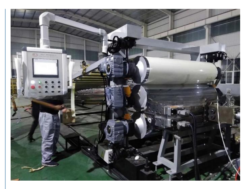
Our customer & exhibition