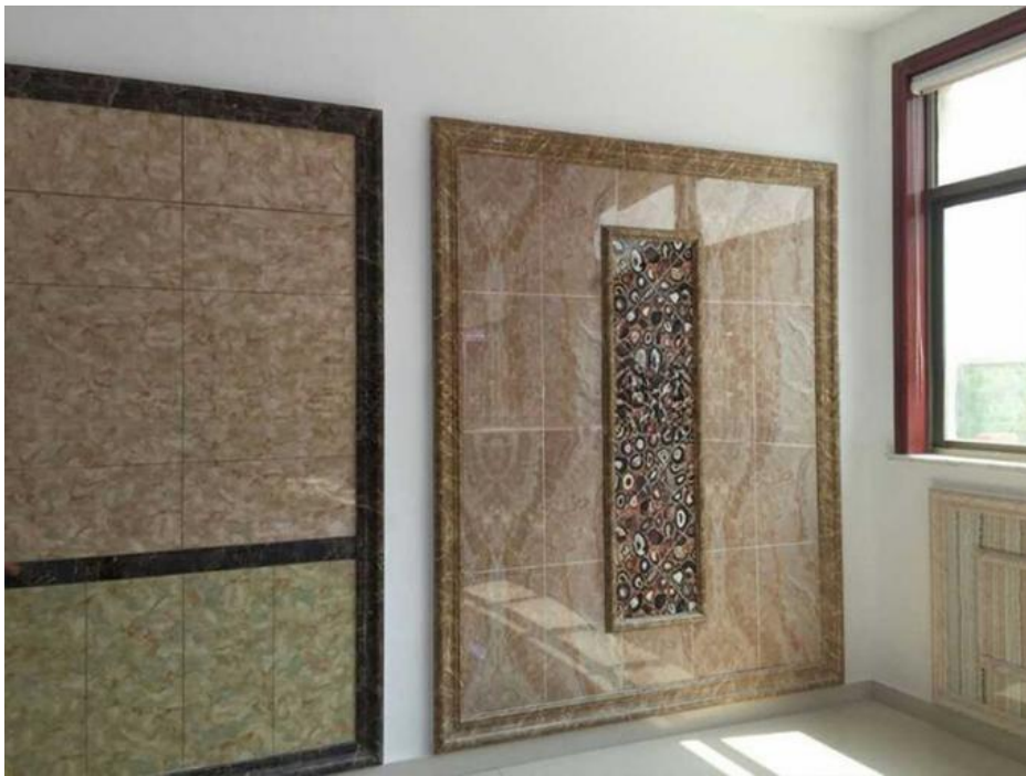
Our customer & exhibition