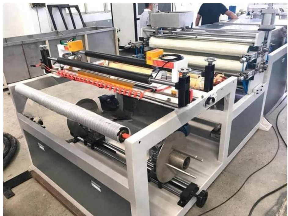
Our customer & exhibition