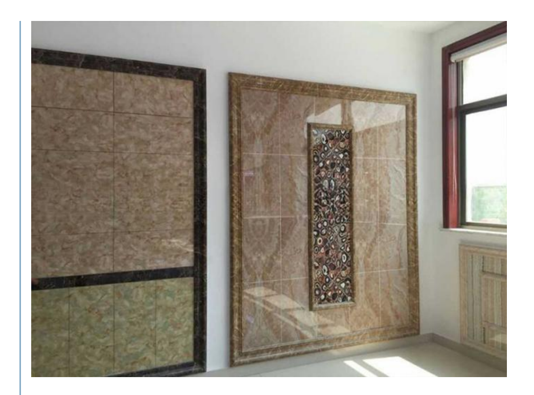
Our customer & exhibition