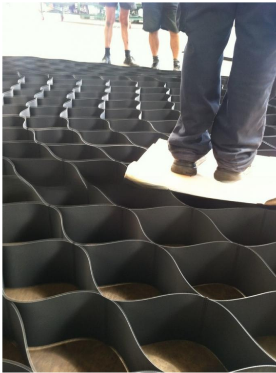
finished Geo cell