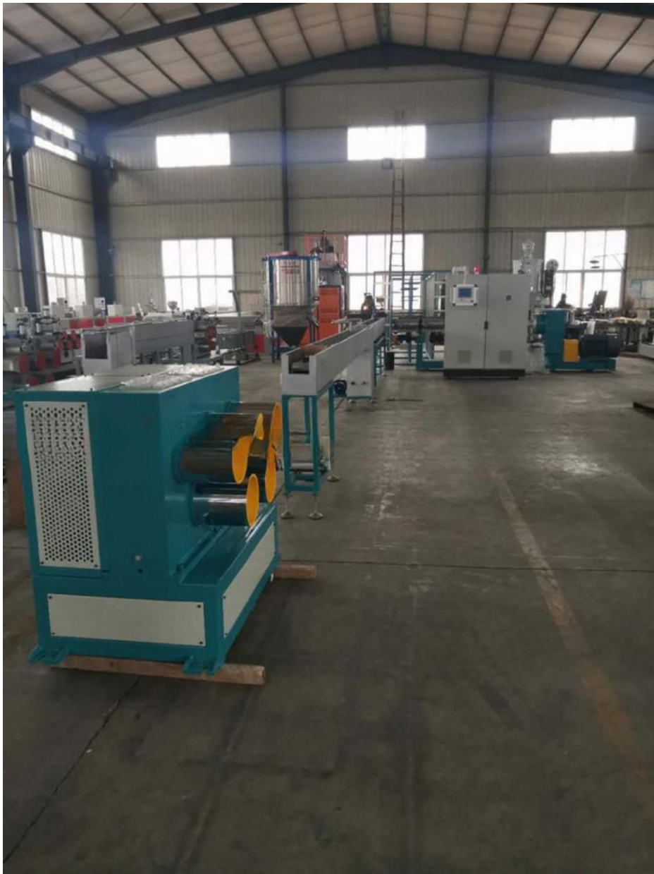
Our customer &exhibition