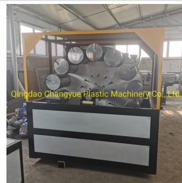
Qingdao Changyue Plastic Machinery Co., Ltd.