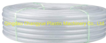
Qingdao Changyue Plastic Machinery Co., Ltd.