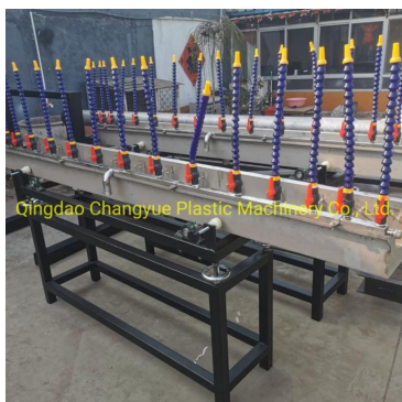
Qingdao Changyue Plastic Machinery Co., Ltd.