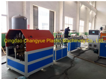
Qingdao Changyue Plastic Machinery Co., Ltd.