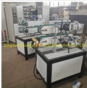
Qingdao Changyue Plastic Machinery Co., Ltd.