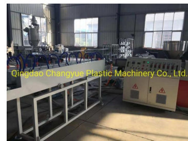
Qingdao Changyue Plastic Machinery Co., Ltd.