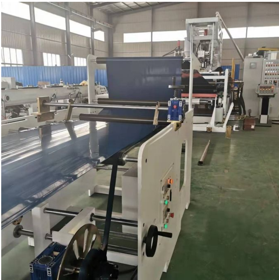
Our customer & exhibition